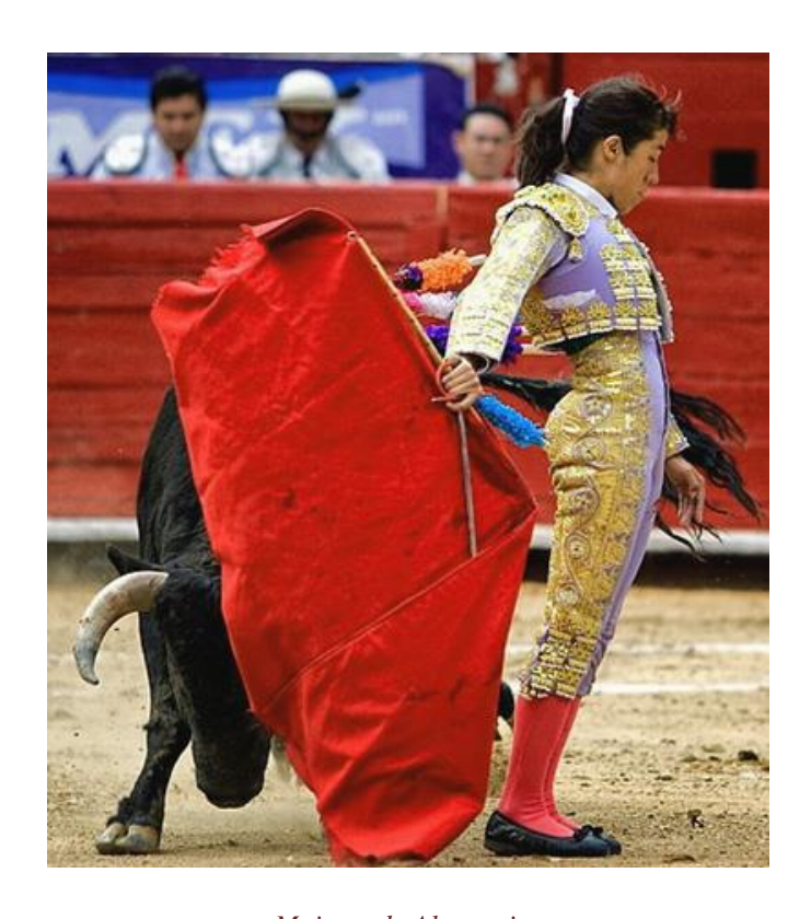
<u>Mujeres de Alternativa</u> <u>bullfightingnews.com</u>

And meet immigrant Extranjeras—Foreign Women in Spain.