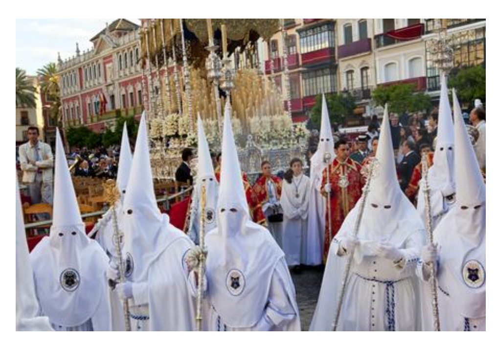
Seville, Spain - April, 2011: Semana Santa de Sevilla Fiesta Easter Andalucia

Holy Week ends there, as in all Catholic Countries, on Easter Sunday.